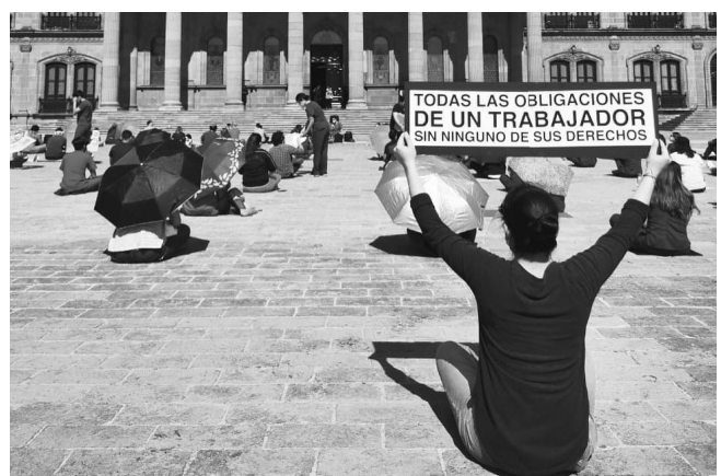
Legend: A medical student with a sign that says "All the obligations of a worker without any of the rights"