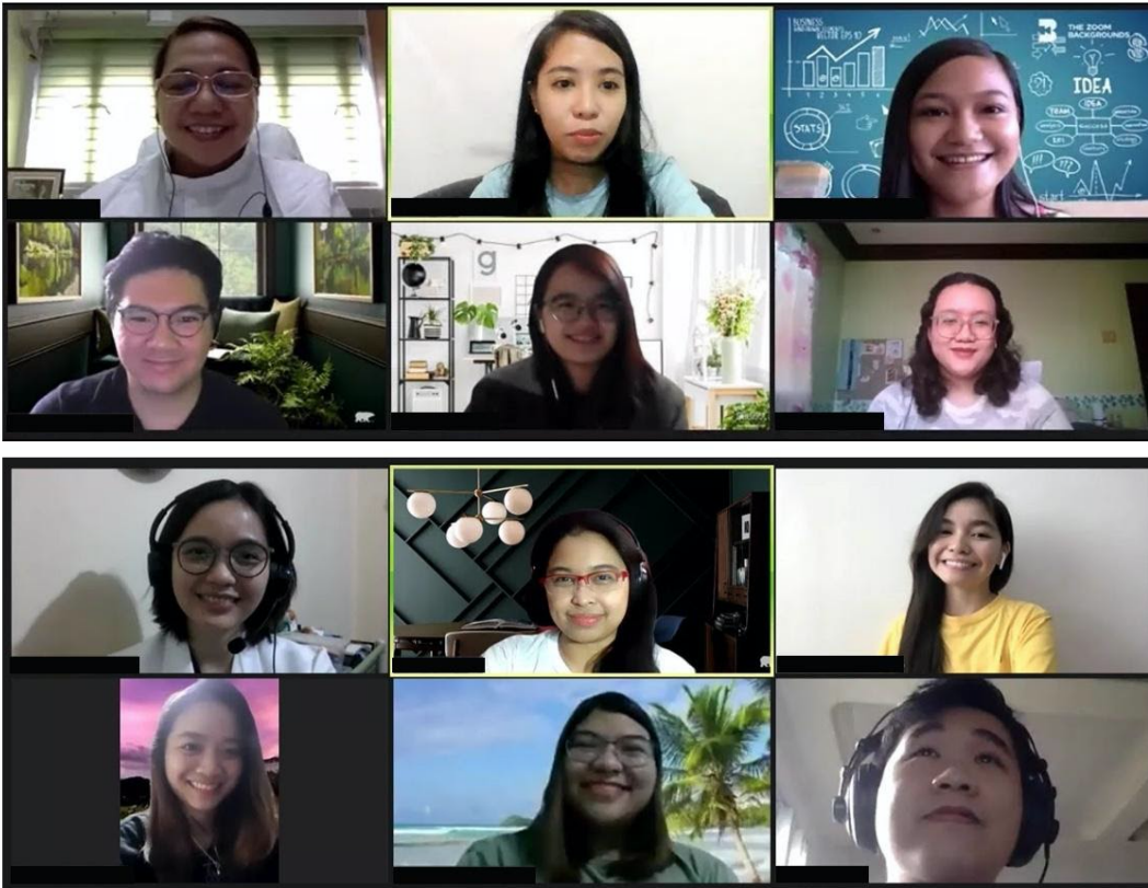
1 Figure 4. Screenshot images of interactive SGDs with preceptors via Zoom meetings during our Internal 2 Medicine rotation. 3