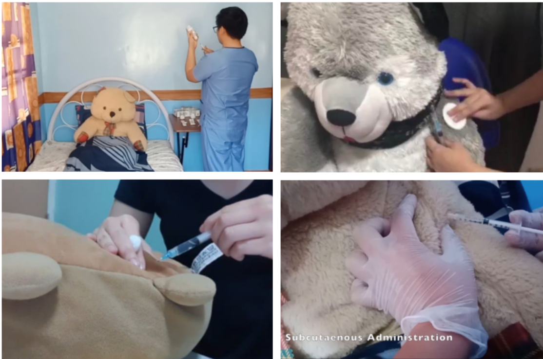
1 Figure 2. A clinical skills simulation on the preparation and administration of parenteral medications on stuffed 2 toys as simulated patients. 3