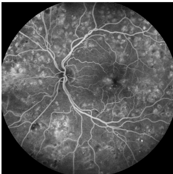
Figure 3. Macular Hyperfluorescence Observed with Fluorescein Angiography in a Diabetic Patient. Petaloid pattern secondary to contrast leakage from perifoveal capillaries to the cystic spaces. There are also panphotocoagulation scars all around the retina.